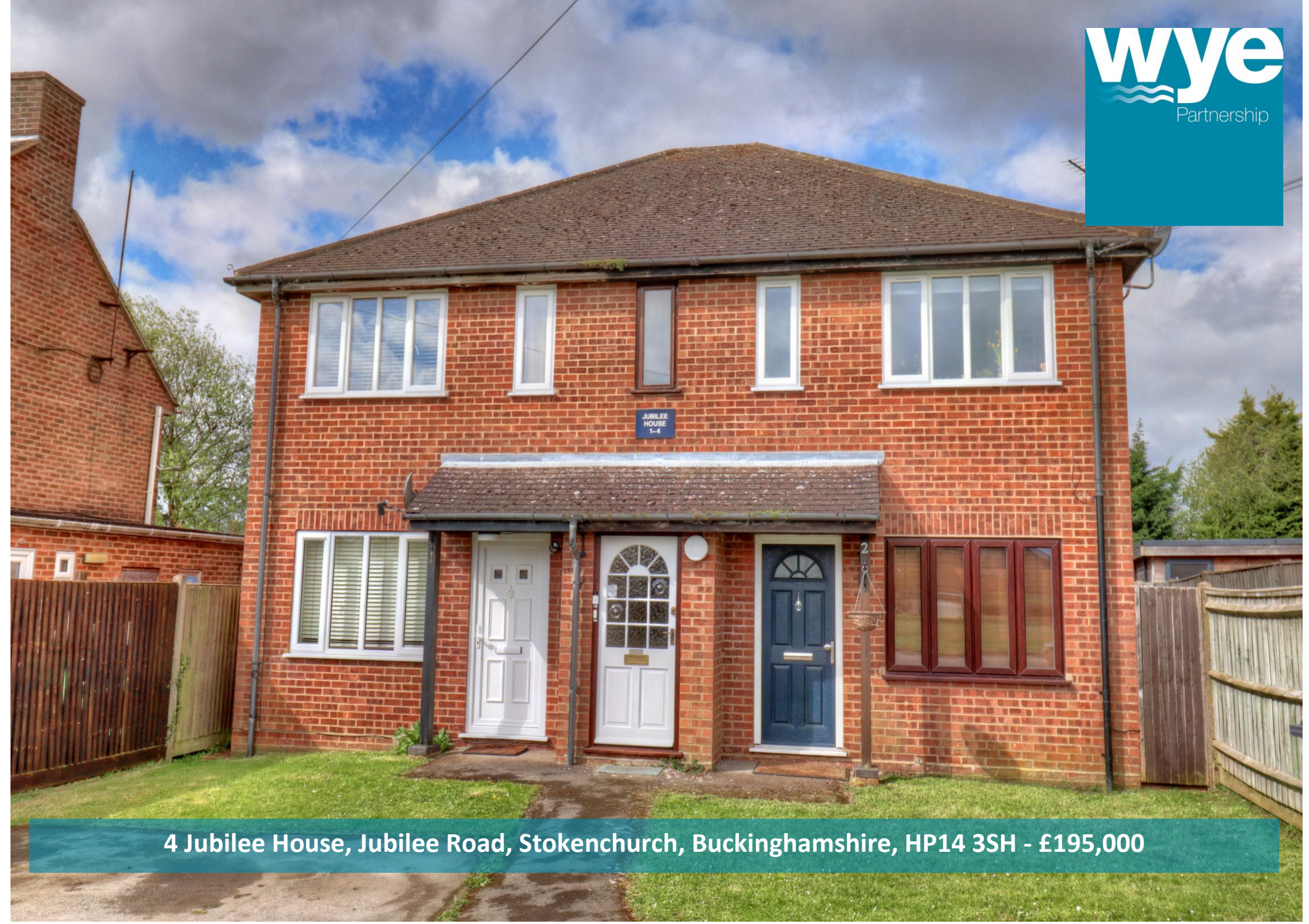
4 Jubilee House, Jubilee Road, Stokenchurch, Buckinghamshire, HP14 3SH - £195,000